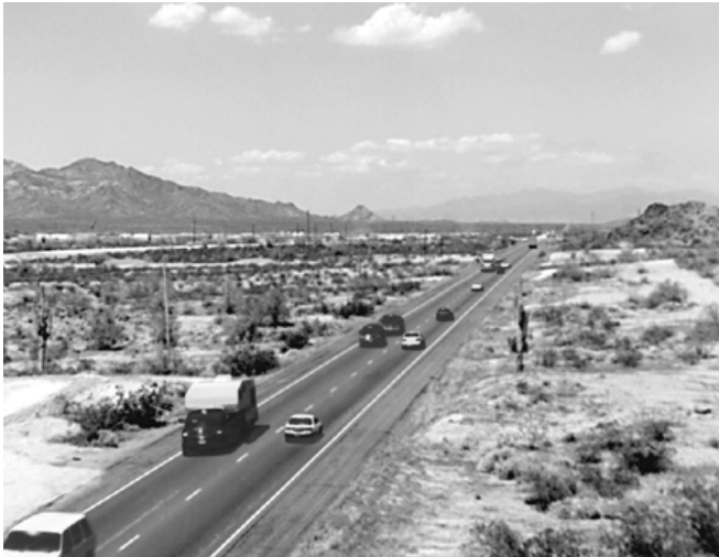
Level of Service "B"

Level of Service (LOS) is a qualitative measure that describes traffic conditions in terms of speed, travel time, freedom to maneuver, comfort, convenience, traffic interruptions, and safety. Six classifications are used to define LOS, designated by the letters A through F. LOS A represents the best conditions, while LOS F represents heavily congested flow with traffic demand exceeding highway capacity. The goal for this analysis is to determine what improvements would need to be made in order to achieve LOS B or better throughout the project area in 2030. The photo simulations below illustrate the conditions at LOS B and E.