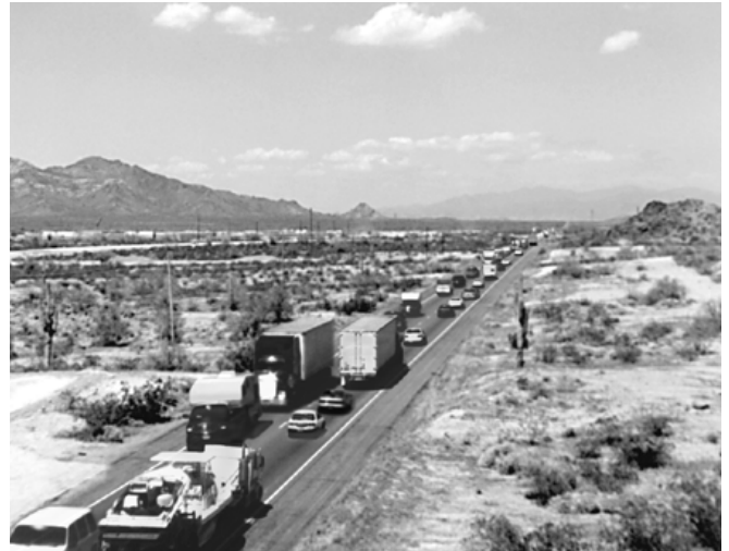
Level of Service "E"

also be considered. The intersection of US 93 and SR 89 will also be studied for improvement. In particular, the public has told ADOT that left turns can be difficult at the existing intersection.